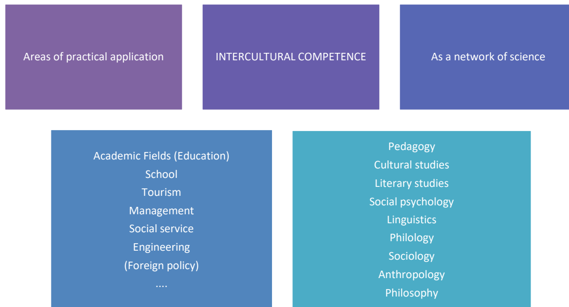
Figure 1. Cross-cultural competence is a field of study and a field of practical application

Intercultural competence is not only a skill that we encounter every day, but also a skill that is always needed. Moreover, it has become the subject of scientific research. As written in the field literature, teaching intercultural competence cannot be done by a single discipline, it requires cooperation between different disciplines. Indeed, research on intercultural communication and competence has been interdisciplinary in nature from the beginning. Even in the 1960s, early North American approaches (on intercultural or crosscultural competence/communication) were based on findings from various disciplines, particularly psychology and linguistics. Today, the range of disciplines involved in the study of intercultural competence has expanded from social psychology, linguistics and economics to sociology, pedagogy and anthropology, philosophy, cultural studies and philology (Figure 1).