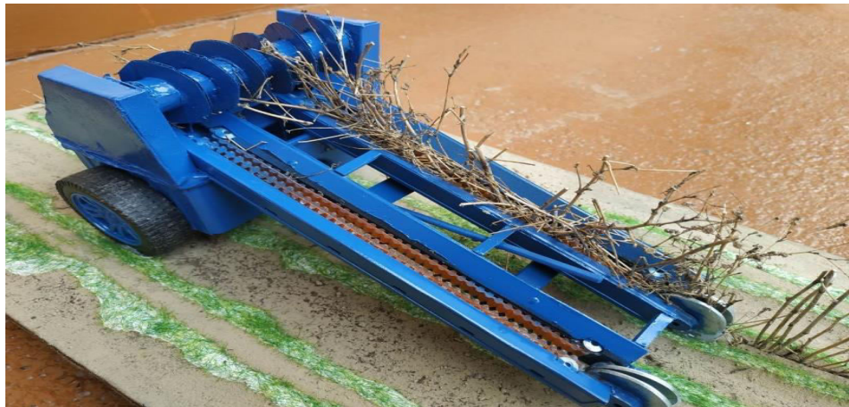
Figure 2. A model of a cotton picking machine.

Based on the above, based on the analysis of the literature and research, a design scheme was developed for a machine that can completely uproot cotton stalks in wheat fields (see Figure 2). During the operation of this machine, the two sides of the cotton stalks are cut with disc knives at a distance of 4-5 cm, and the cotton stalks are pulled out using a drum equipped with special clamps. As a result, the roots of wheat seedlings are pulled out of the cotton stalks without transplanting. This saves resources and increases productivity.