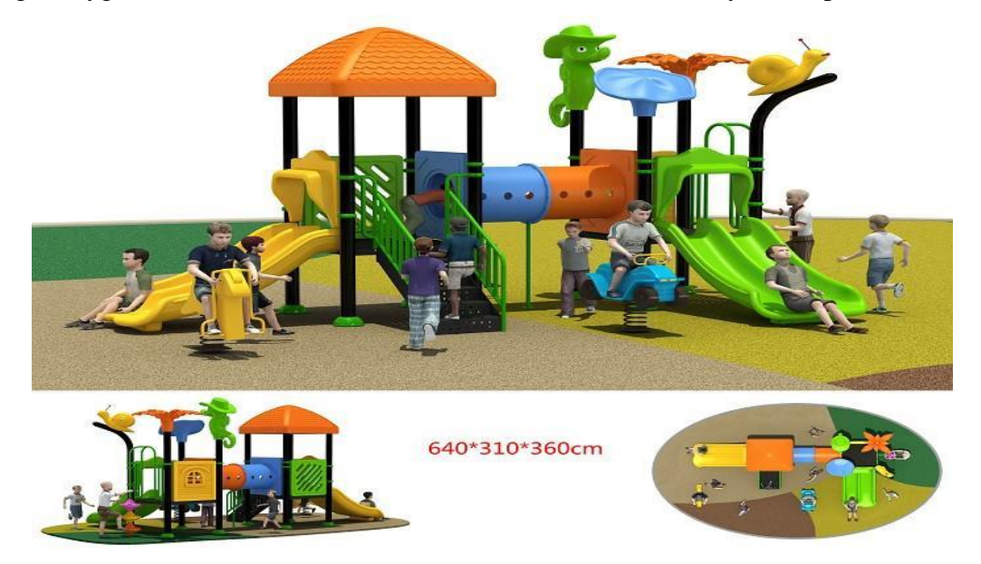
Figure 3; children's playground.

Woods, Landscaping, Walkways, Benches and Seats, Trash Boxes, Toilets, Amusements, Small and Large Playgrounds, Soft Drinks, Ice Cream Sale, Summer Variety or Amphitheater. [3]