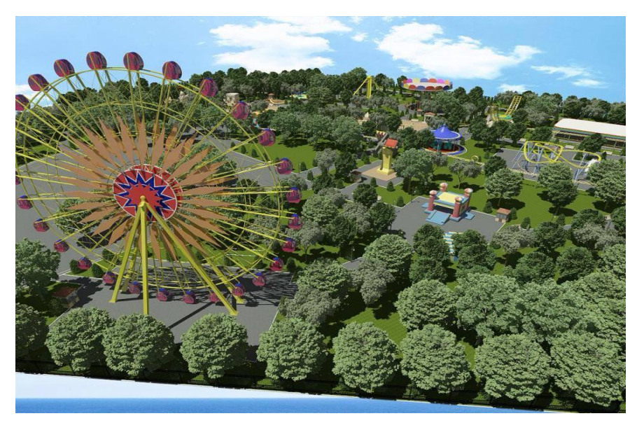
Figure 1; Amusement park.

huge trees. The water coming from the river was carried up by special devices. It contained plants and animals. There are even artificial waterfalls.