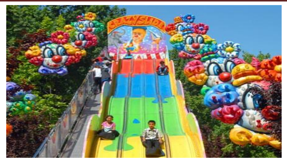
Figure 2: Attraction.

The main objects in the park should be: Tree, Landscaping, Walkways, Seating,