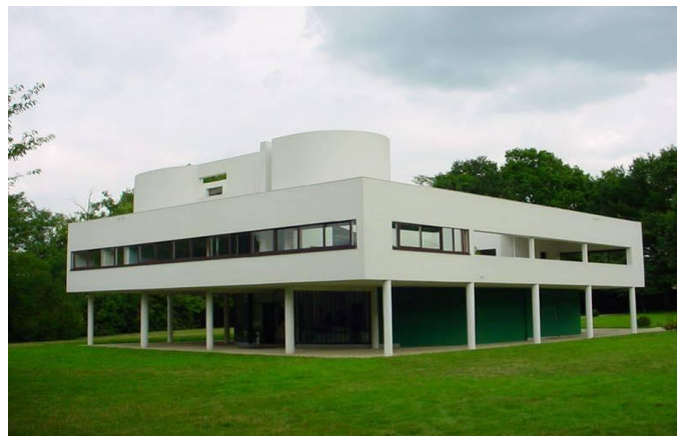
Villa Savoy Arch. - Le Corbusier, Poissy, France, 1929 - 1930. General form

While decorating an open terrace, you can show all your imagination and use the most unusual materials for its arrangement. But of course, plants play the "main violin" in the design of an open terrace - they can be used to decorate the building and give it a unique look. The cobbled summer terrace, decorated with plants and different flowers, can be a great place to relax for years to come.