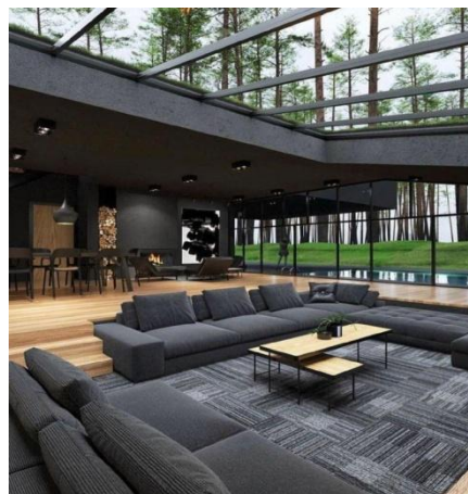
Terrace with a transparent roof

Vegetation can also play the role of a visual barrier on a terrace without walls. If you do not erect a railing, you can create the impression of a secluded area in a dense thicket.[10]