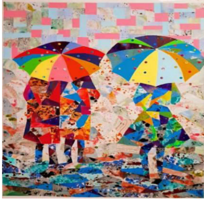
"Under the rain"