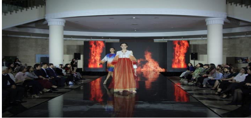
“Nature on fire style”

That this, in turn, gave students endless energy and enthusiasm. At the heart of everything that is done is the work of our students and teachers. [2] In addition, on April 24, 2021, with another initiative of this direction of the university, the first exhibition of freshmen and sophomores "AVALORE" (Flight) was opened. The exhibition lasted from April 24 to May 6 and featured more than fifty works by 30 authors in various styles. The works are paintings and graphics, sculptures, as well as collages and applications. The theme of the exhibition reflected the wide range of approaches of the participants.