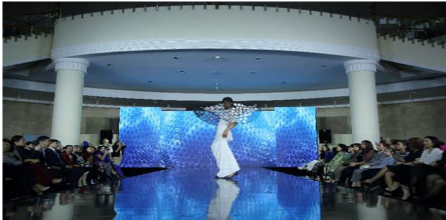
“Blac Whit Cosmic”

That this, in turn, gave students endless energy and enthusiasm. At the heart of everything that is done is the work of our students and teachers. [2] In addition, on April 24, 2021, with another initiative of this direction of the university, the first exhibition of freshmen and sophomores "AVALORE" (Flight) was opened. The exhibition lasted from April 24 to May 6 and featured more than fifty works by 30 authors in various styles. The works are paintings and graphics, sculptures, as well as collages and applications. The theme of the exhibition reflected the wide range of approaches of the participants.