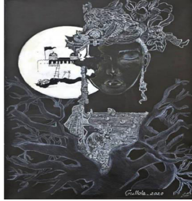
"Tree of life"

The Association of Artists praised the potential of teachers and students, noting that these exhibitions play an important role in the development of students and the institute. Students who actively participated with their works, supporting students and supporting their creativity, were encouraged by the institute. The works of our young people and their tireless and fruitful work to achieve such success are the evidence of their interest in the field, which will serve as a basis for the future enrichment of the world of fashion with modern ideas. [4]