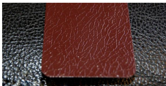
Figure 2. Plastisol coating

Plastisol, like PVDF coating, has excellent decorative properties. In terms of cost, it is the most expensive, but at the same time it has the best resistance to mechanical damage. Figure 2. Plastisol is applied in a thick layer (up to 200 microns) and is used to create textured coatings, embossed surfaces and stamped patterns.