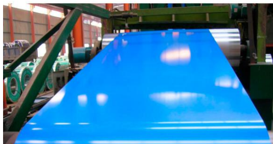
Figure 1. Polyester coating

Polyester. Polyester (polyester) is the most popular polymer used as a coating. It is characterized by high resistance to UV radiation, excellent anti-corrosion properties, elasticity (easy to form). Figure 1. The polyester coating can withstand almost any temperature - both low and high. Compared to other types of polymers, polyester is the most affordable. Compared to other types of polymers, polyester is the most affordable. Not too outstanding strength characteristics of the material are compensated for by additional processing with quartz sand. However, the cost of coating is increased. Transportation of products with a polyester-quartz protective layer presents certain difficulties, since sand can damage adjacent surfaces.