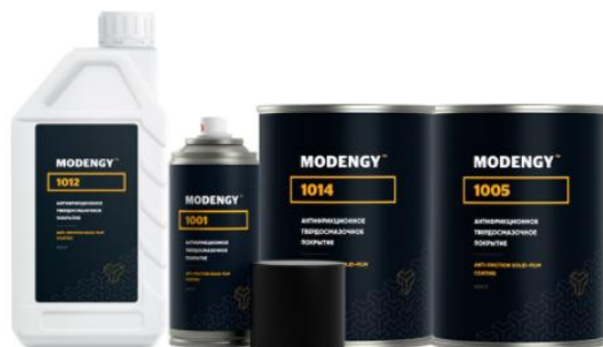
Figure 4. Polymer anti-friction coating

Typical coating units are medium and heavy loaded bearings, guides, gears, internal combustion engine parts (piston skirts, throttle valve, etc.), Threaded joints and other friction pairs made of various materials (metals, rubbers, plastics.) MODENGY anti-friction solid lubricating coatings are applied once for the entire service life of parts, which allows you to completely abandon oils and greases for further maintenance.