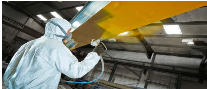
Figure 5. The spray gun coating

Equipment plays a major role in polymer spray coating. Figure 5.